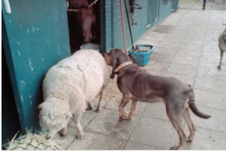
Do I know You ?